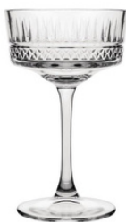
Clara Coupe 260ml / Qty 110 16.4cmH