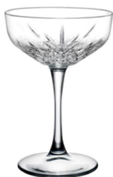
Evelyn Coupe 270ml / Qty 110 15.7cmH