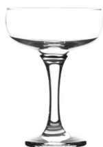
Daisy Coupe 235ml / Qty 180 13.5cmH