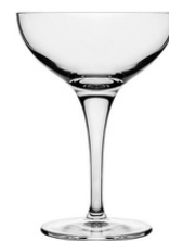
James Coupe 240ml / Qty 70 14.6cmH