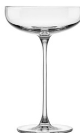
Remy Coupe 220ml / Qty 45 17.4cmH